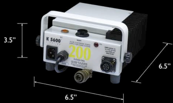
Weight: 4.4 lbs (2 kg)